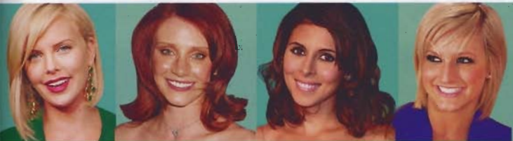
THE 12 MOST-WANTED SUMMER STYLES

WOW! Inexpensive vibrating razors get you 52% smoother